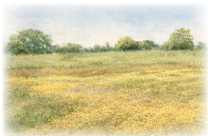
Permanently Conserved 47 Acre Natural Habitat