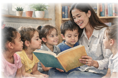
Sliding Scale Neighborhood Pre-K