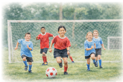
New Centrally-Located Community Park with Needed Playfields