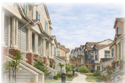
A Diverse Mix of Affordable & Attainable Housing