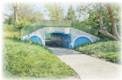
Two Grade-Separated Crossings Connecting Wildhorse & Northstar